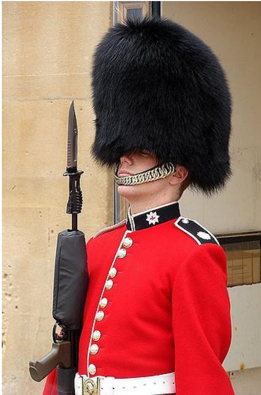
© Márcio Cabral de Moura used under a Creative Commons License